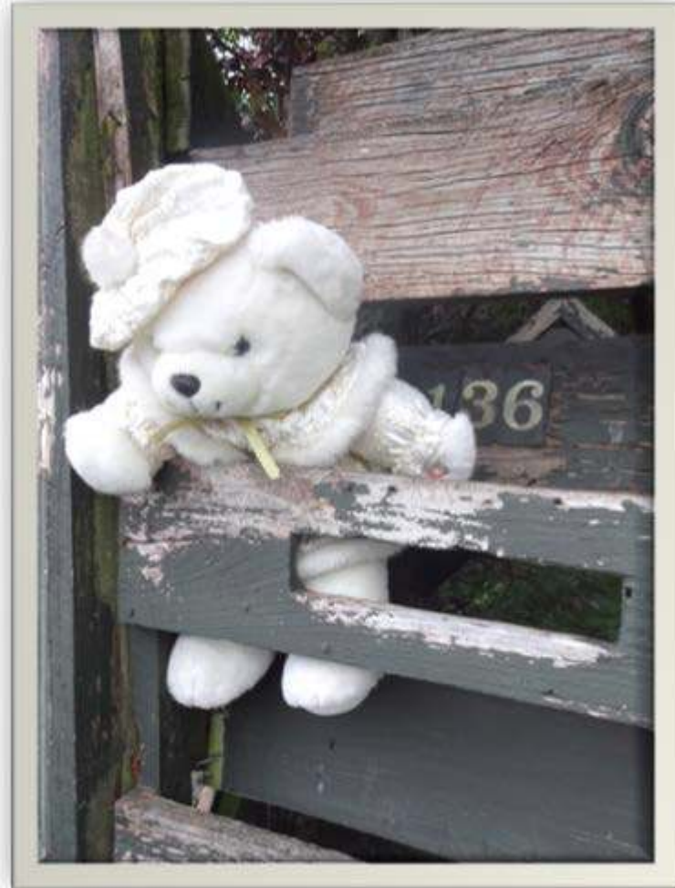
Missy at No.136