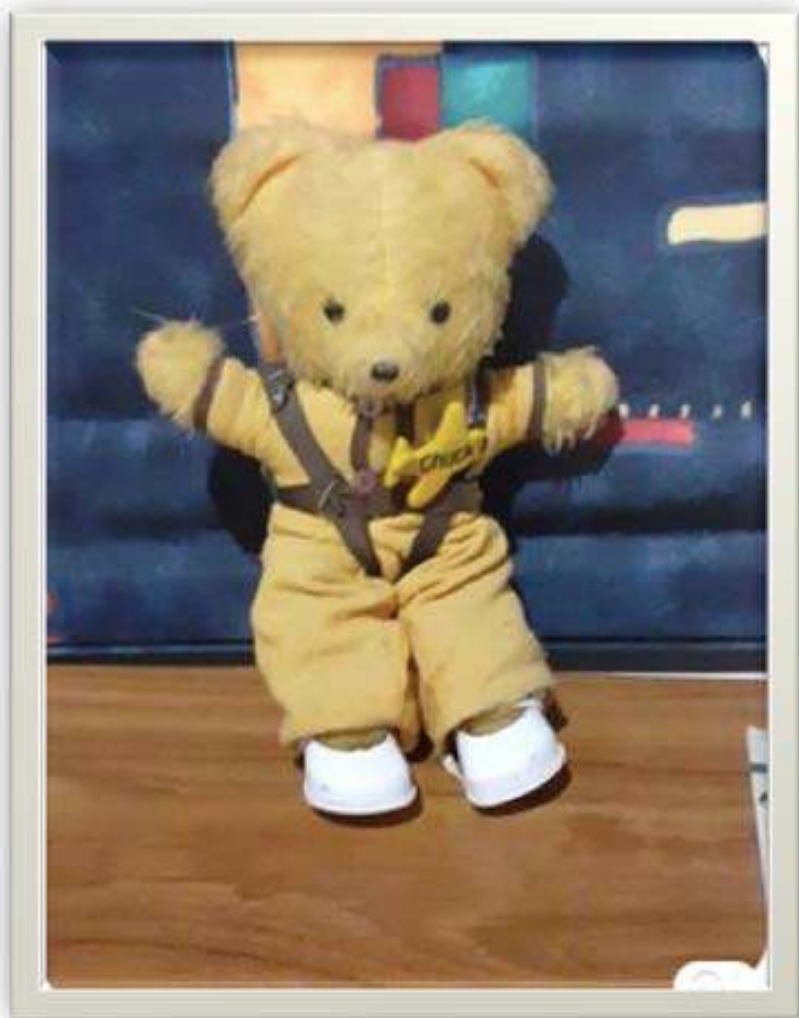
Chuck the Flying Ace