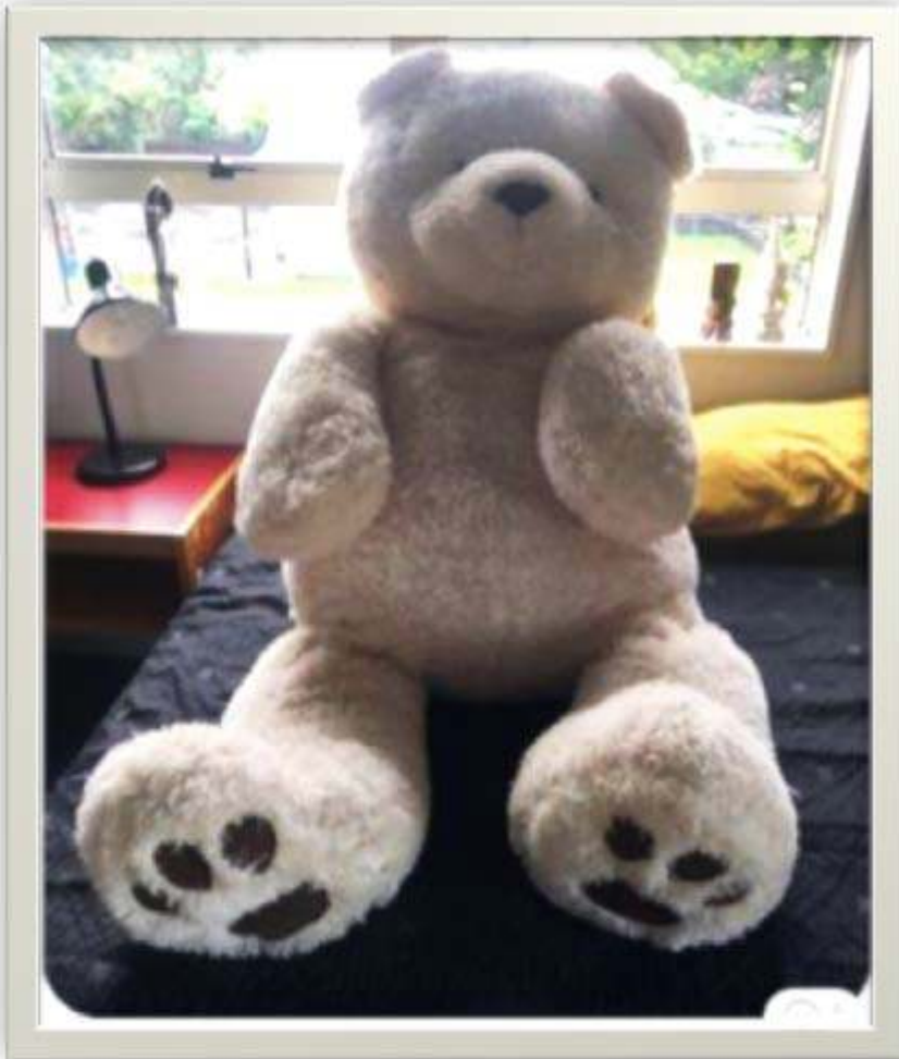
Winny of Paroa